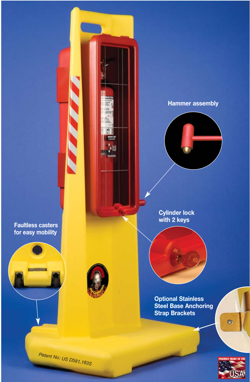
(Extinguisher not included)

Plastic Cabinet (PC-Sold separately on page 19) cabinet with body and frame injection molded in red virgin high-impact crystal polystyrene of .110 wall thickness with ultra-violet inhibitors, virgin acrylic Plaskolite® panel of .080 thickness. Chromium plated brass safety lock and key, polypropylene plastic injected molded hammer.